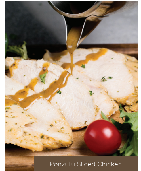
Ponzufu Sliced Chicken