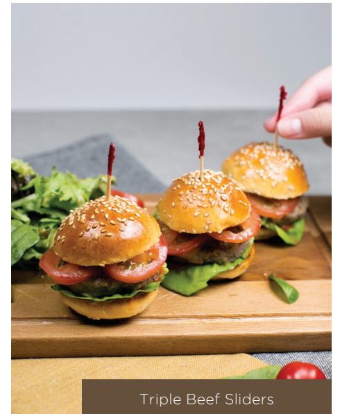
Triple Beef Sliders