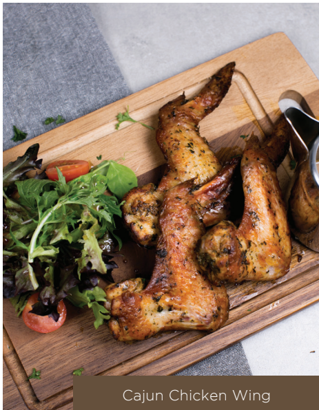
Cajun Chicken Wing