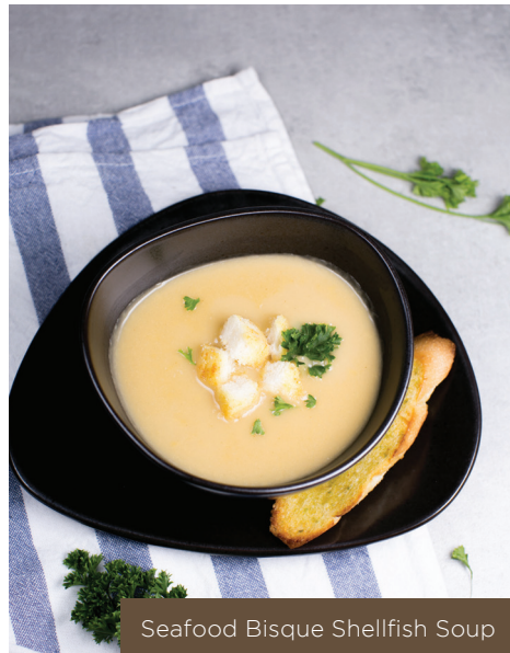
Seafood Bisque Shellfish Soup