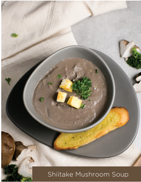
Shiitake Mushroom Soup